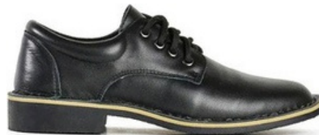
Can be worn with