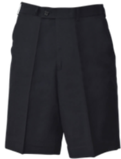
Flat Front Shorts