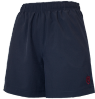
PE Shorts Regular