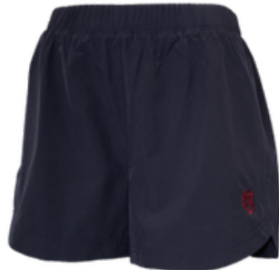
PE Shorts Dawn