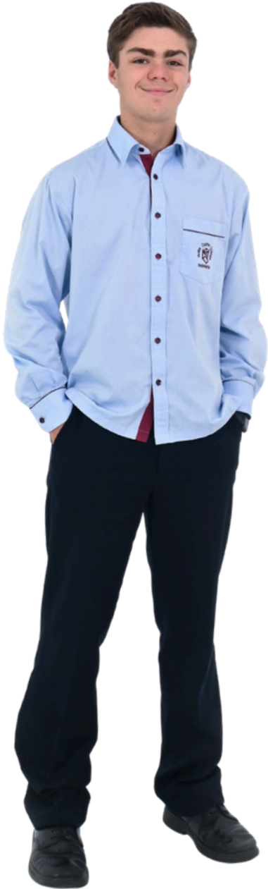
Can be worn with