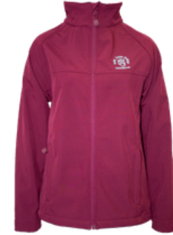
Soft Shell Jacket