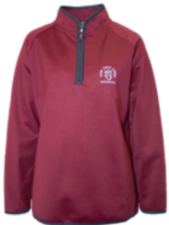
Quarter Zip Top