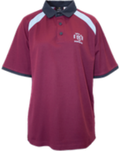
Short Sleeve Polo