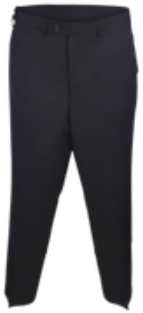
Flat Front Trouser