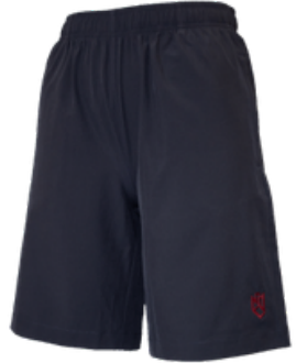
PE Shorts Long